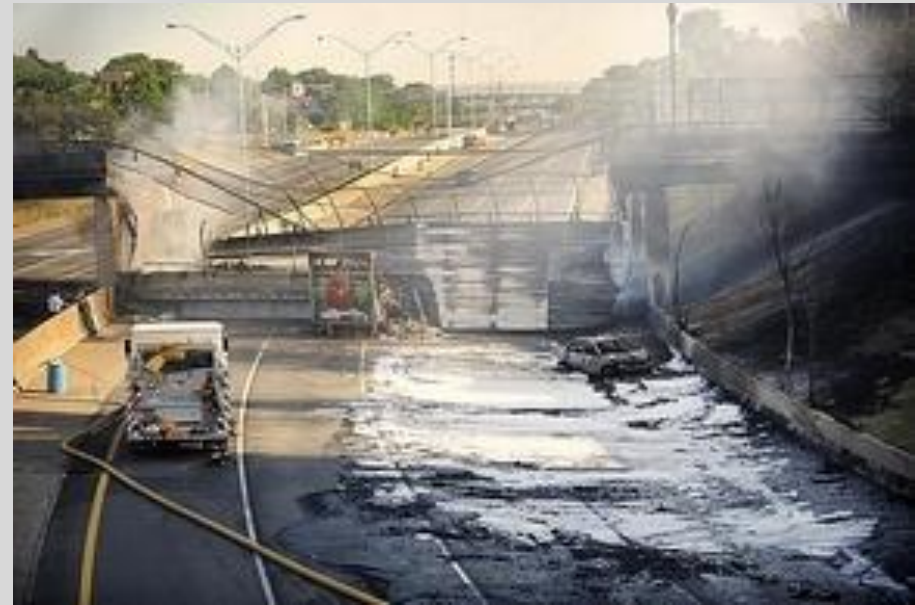
The Nine Mile overpass across north-bound I-75 continues to smolder Thursday morning. Cargo Tank 07/15/2009